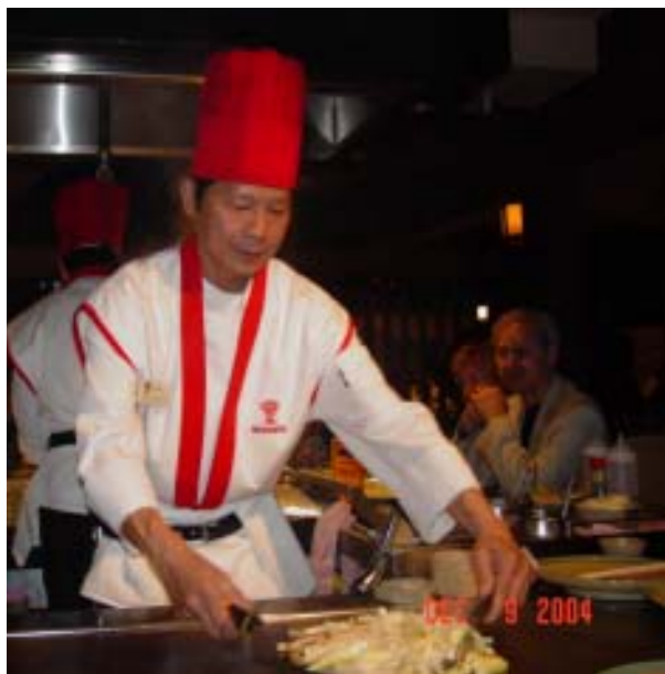
NASBE Dinner at Japanese Benihana Village Restaurant in the Hilton