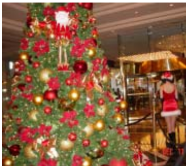
Christmas Glitz & Glitter in Las Vegas

The Career Tech Update Newsletter is now being published in an e-mail format. This newsletter will be free to all ACTE members starting in 2003. This is yet another reason to make sure ACTE has your e-mail address.