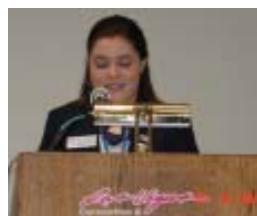
National FBLA President brings greetings