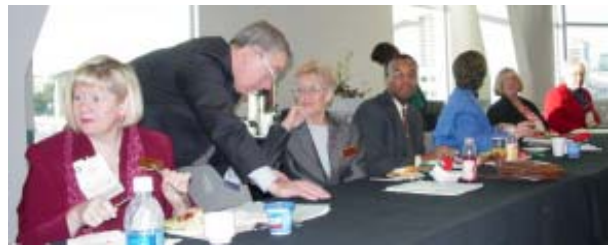
Above & Below: NASBE Exec. Bd. Mtg. Las Vegas