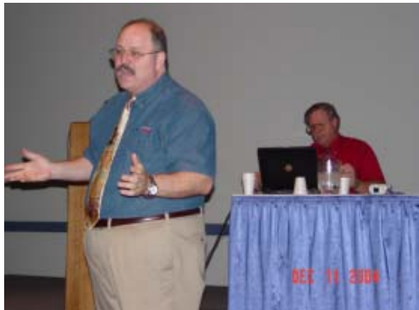
Above: Business Session Speaker "Show Me The Students"